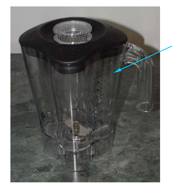
48oz Container Complete* 6126-600

Replacement Parts Diagram Model HBH650-CE (Series A-K) PROPRIETARY RIGHTS NOTICE This document and all information contained within it is the property of Hamilton Beach Brands, Inc. (HBB). It is confidential and proprietary and has been provided to you for a limited purpose. It must be returned or destroyed upon request. Disclosure, reproduction or use of this document and any information contained within it, in full or in part, for any purpose is forbidden without the prior written consent of HBB. No photographs may be taken of any article fabricated or assembled from this document without the prior written consent of HBB. from this document without the prior written consent of HBB.